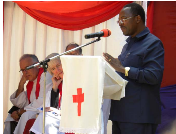
National MP for Local Government