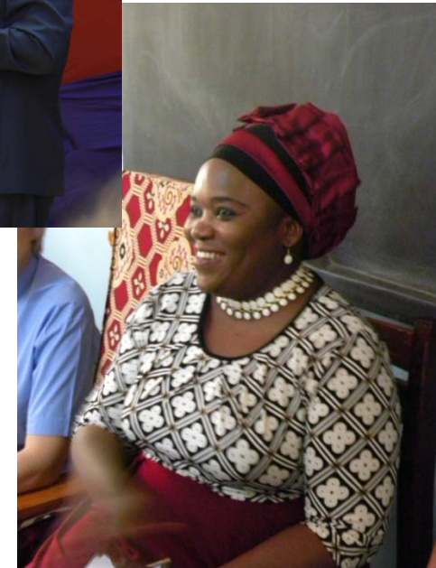
Kondoa District Commissioner